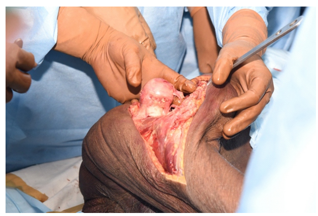
Pictures from Cadaveric Pelvi Acetabular Fracture Fixation Workshop & CME: 2015 Register for 2016 course 19-20th November at Lucknow. Registration Details on Website of Trauma International