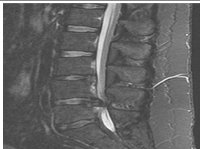
Figure 2: Axial T2-Weighted MRI