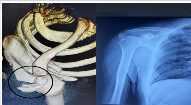
Figure 1: Pre-operative X-ray and 3D CT images