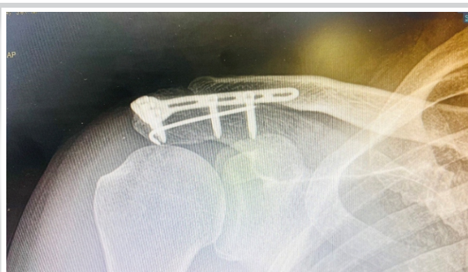
Figure 5: 3 months post-operative X-ray showing perfect union

As already mentioned that isolated acromion fractures are uncommon as these fractures are usually associated with other complex injuries of shoulder and these fractures are usually treated conservatively at most of the places. Acromion fractures however should be given a surgical