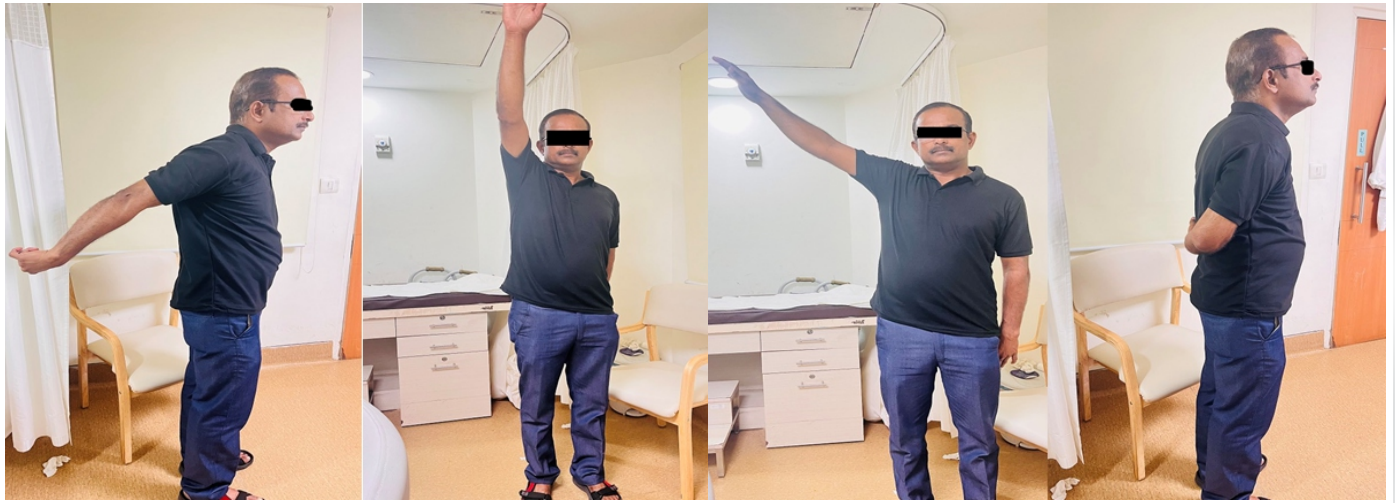
Figure 6: ROM of the operated shoulder at the end of 6 months

option at the places where they appear to be grossly displaced or there are radiological evidence of reduced sub acromial space, in future these displaced fractures may lead to signs of shoulder impingement along with early setting in of osteoarthritis of shoulder. The lifelong complaints of pain in the affected shoulder is a task to handle for both